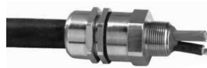
Dimensions in Millimeters (Inches)